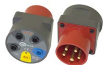
Three-phase socket adapter 16 A / 32 A