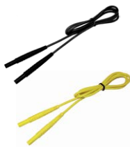
Test lead 1.2 m (banana plugs) black / yellow

U1 / I1 WAPRZ003DZBBU111 U2 / I2 WAPRZ003DZBBU212