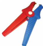
2x Kelvin clamp, 1 kV, 25 A