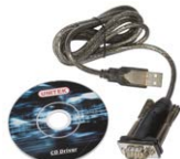
RS-232 serial transmission cable