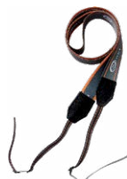
M1 hanging straps